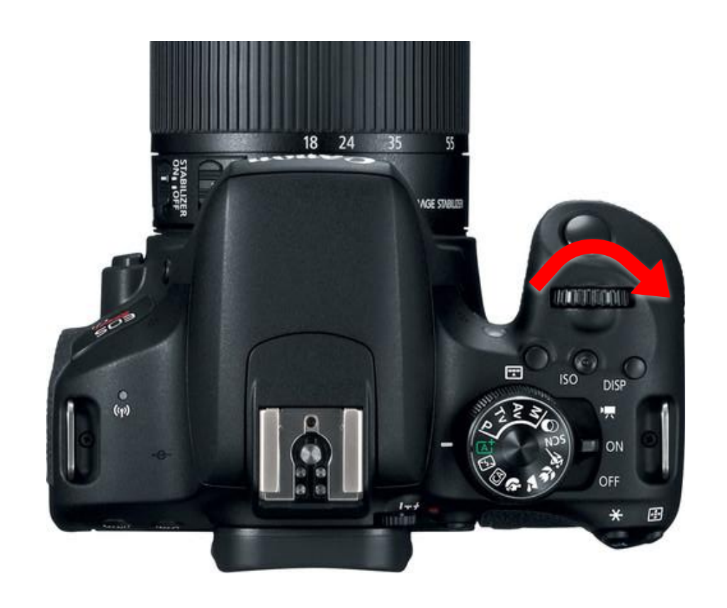
TURN THE MAIN DIAL TO ADJUST TO 1/60