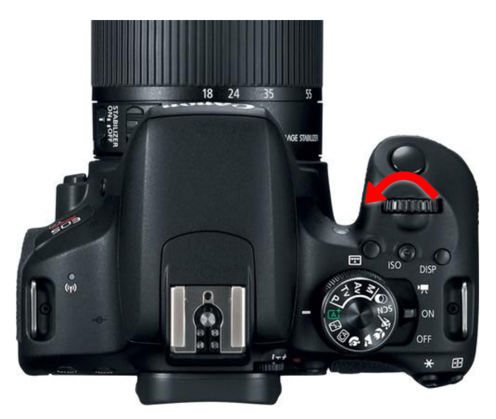
PRESS AND HOLD THE APERTURE BUTTON AND TURN THE MAIN DIAL TO ADJUST TO 5.6